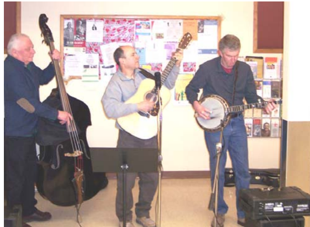
The "Why Nots", a local Bluegrass band performed for us at our "Bring Friends" potluck meeting.